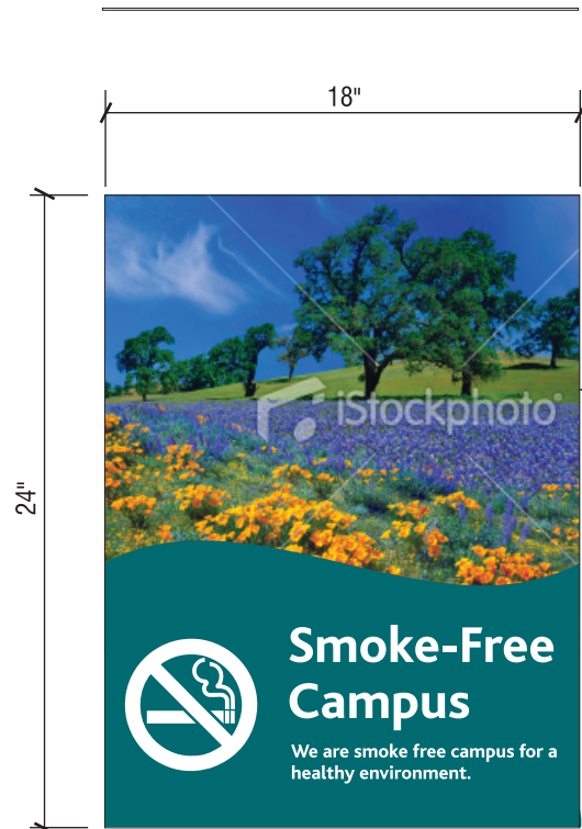
PANEL SIGN - SIGN TYPE SM.3 SCALE: 1/8"=1" QTY: 36

.080" THICK ALUMINUM WITH A 4-COLOR DIGITAL PRINT APPLIED TO THE PANEL FACE. DIGITAL PRINT LAMINATED WITH 15mil POLYCARBONATE VELVET UV DISPLAY FLEX