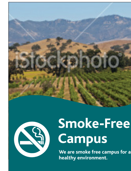
OPTIONAL IMAGE 4