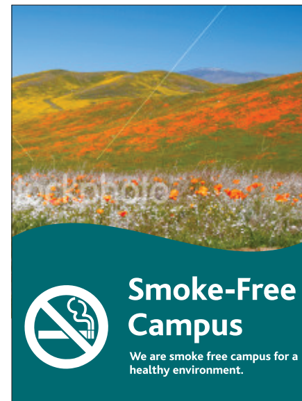
OPTIONAL IMAGE 3