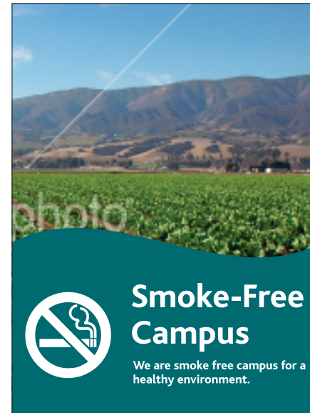
OPTIONAL IMAGE 1

NOTE: (35) SIGNS TO INCLUDE STUDS FOR MOUNTING, (1) SIGN TO BE MOUNTED TO GLASS WITH VHB TAPE AT THE BUS STOP ON ROMIE LANE.