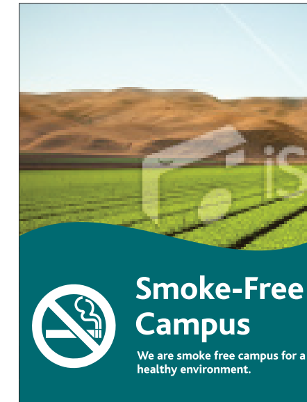
OPTIONAL IMAGE 2