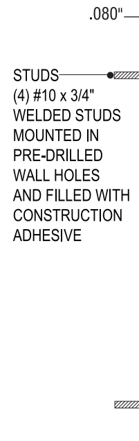
SIDE VIEW SCALE: 1/8"=1"