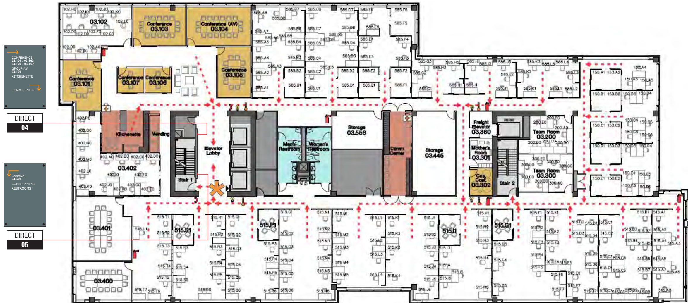
3RD LEVEL FLOOR PLAN

PRIMARY ELECTRICAL TO SIGN LOCATIONS IS TO BE PROVIDED BY OTHERS. 20 AMP DEDICATED CIRCUIT(S) WITH NO SHARED NEUTRALS AND A GROUND RETURNING TO THE PANEL IS REQUIRED FOR ALL INSTALLATIONS. THIS SIGN IS INTENDED TO BE INSTALLED IN ACCORDANCE WITH THE REQUIREMENTS OF ARTICLE 600 OF THE NATIONAL ELECTRICAL CODE AND/OR OTHER APPLICABLE LOCAL CODES. THIS INCLUDES PROPER GROUNDING AND BONDING OF THE SIGN.