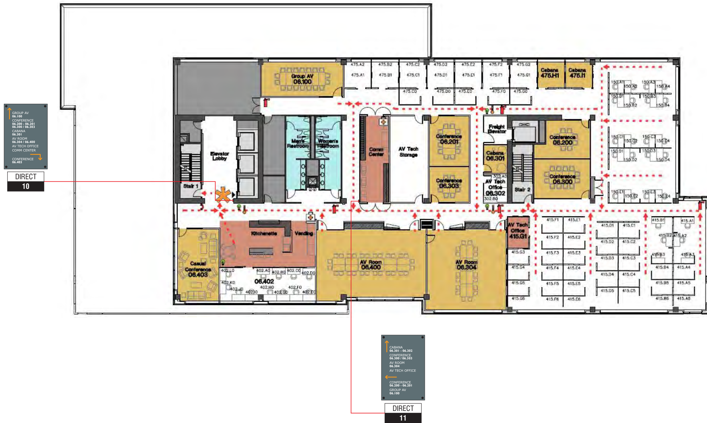
6TH LEVEL FLOOR PLAN

PRIMARY ELECTRICAL TO SIGN LOCATIONS IS TO BE PROVIDED BY OTHERS. 20 AMP DEDICATED CIRCUIT(S) WITH NO SHARED NEUTRALS AND A GROUND RETURNING TO THE PANEL IS REQUIRED FOR ALL INSTALLATIONS. THIS SIGN IS INTENDED TO BE INSTALLED IN ACCORDANCE WITH THE REQUIREMENTS OF ARTICLE 600 OF THE NATIONAL ELECTRICAL CODE AND/OR OTHER APPLICABLE LOCAL CODES. THIS INCLUDES PROPER GROUNDING AND BONDING OF THE SIGN.