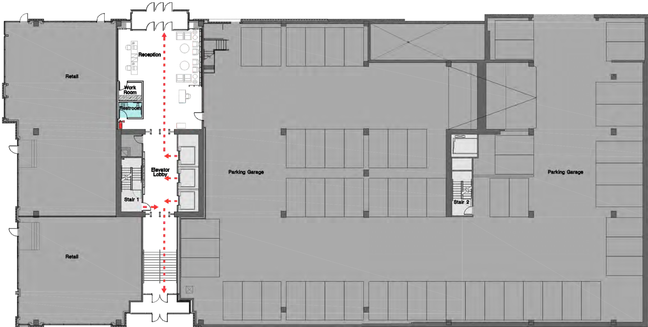
1ST LEVEL FLOOR PLAN NO SCALE