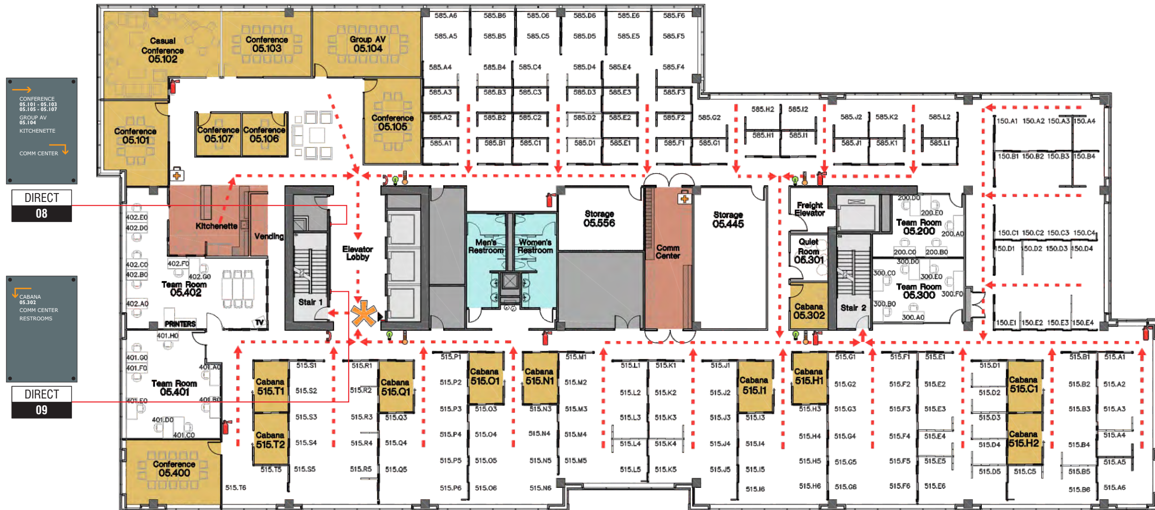
5TH LEVEL FLOOR PLAN

PRIMARY ELECTRICAL TO SIGN LOCATIONS IS TO BE PROVIDED BY OTHERS. 20 AMP DEDICATED CIRCUIT(S) WITH NO SHARED NEUTRALS AND A GROUND RETURNING TO THE PANEL IS REQUIRED FOR ALL INSTALLATIONS. THIS SIGN IS INTENDED TO BE INSTALLED IN ACCORDANCE WITH THE REQUIREMENTS OF ARTICLE 600 OF THE NATIONAL ELECTRICAL CODE AND/OR OTHER APPLICABLE LOCAL CODES. THIS INCLUDES PROPER GROUNDING AND BONDING OF THE SIGN.