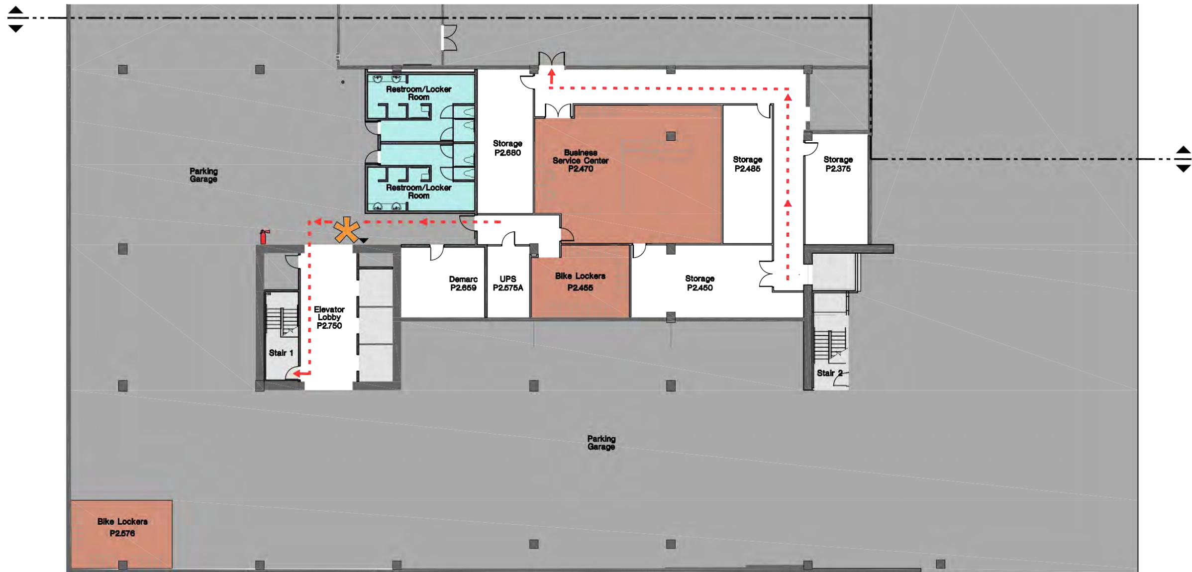
PARKING LEVEL P2 FLOOR PLAN