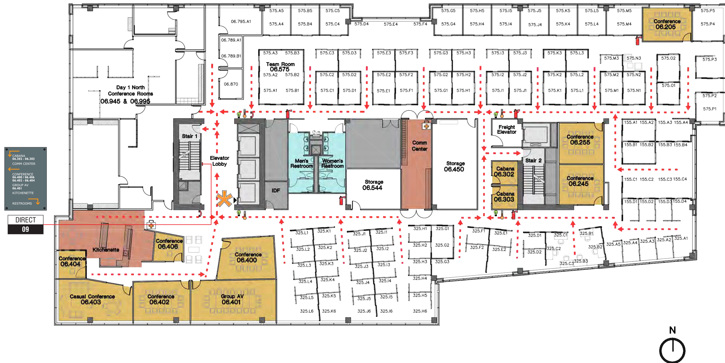
6TH LEVEL FLOOR PLAN