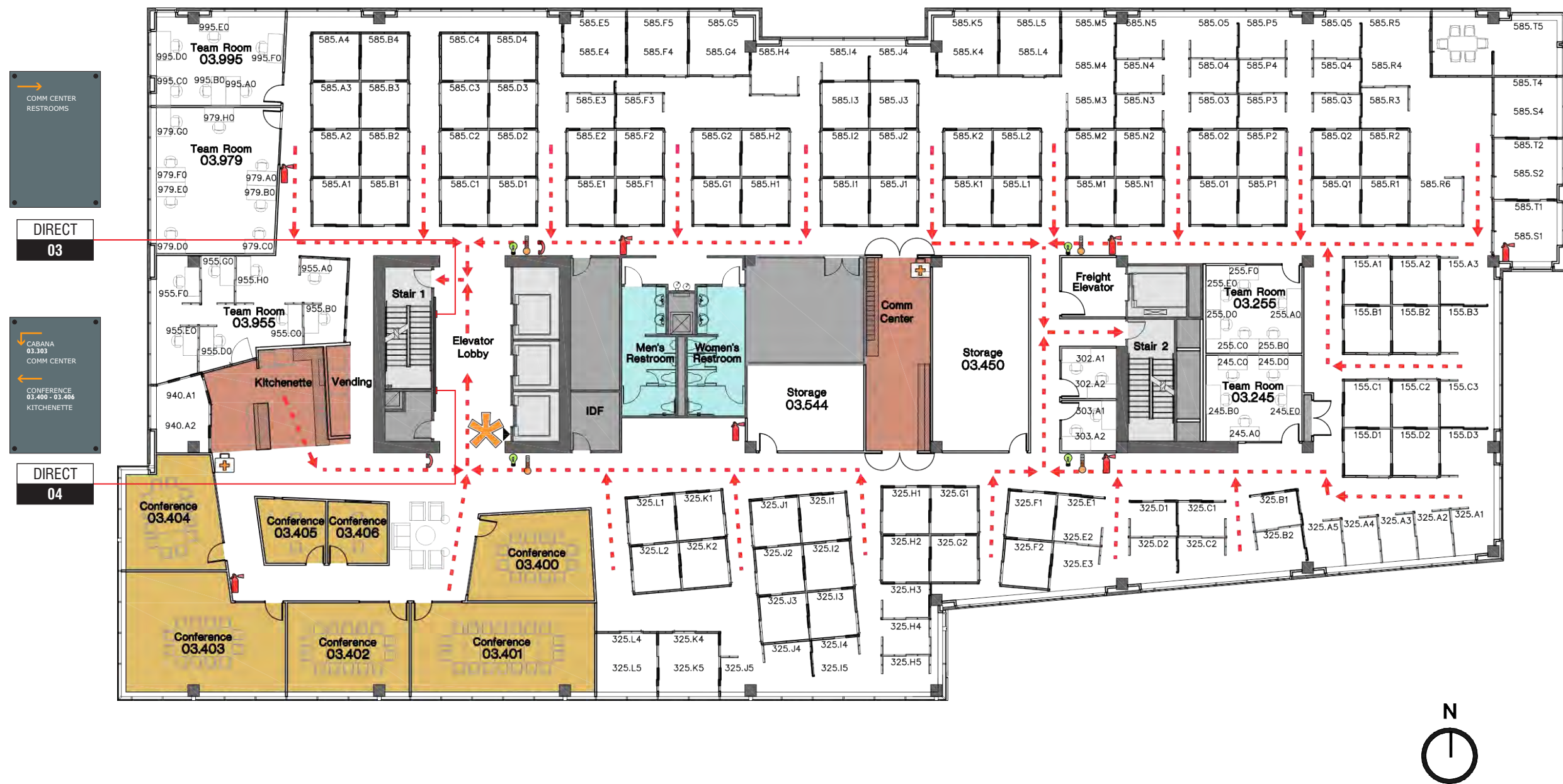
3RD LEVEL FLOOR PLAN