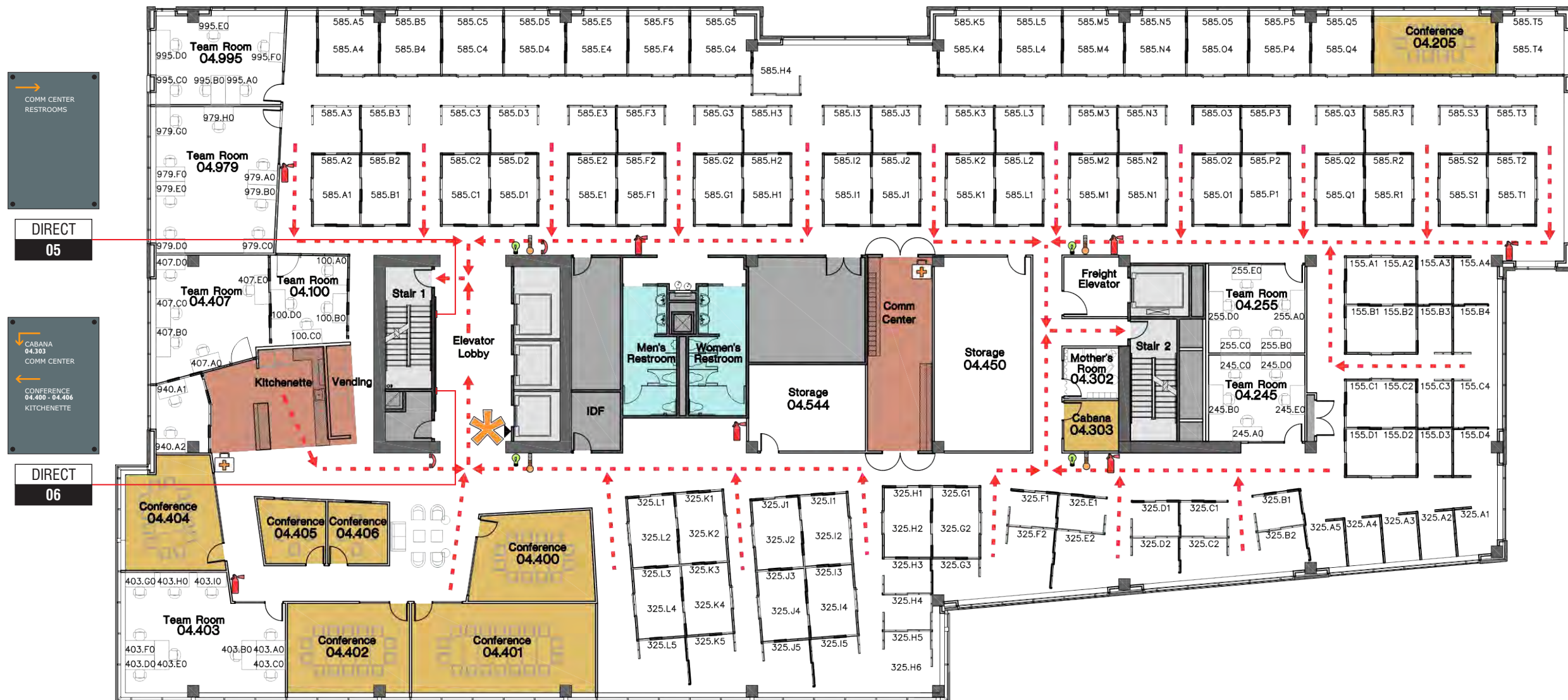
4TH LEVEL FLOOR PLAN