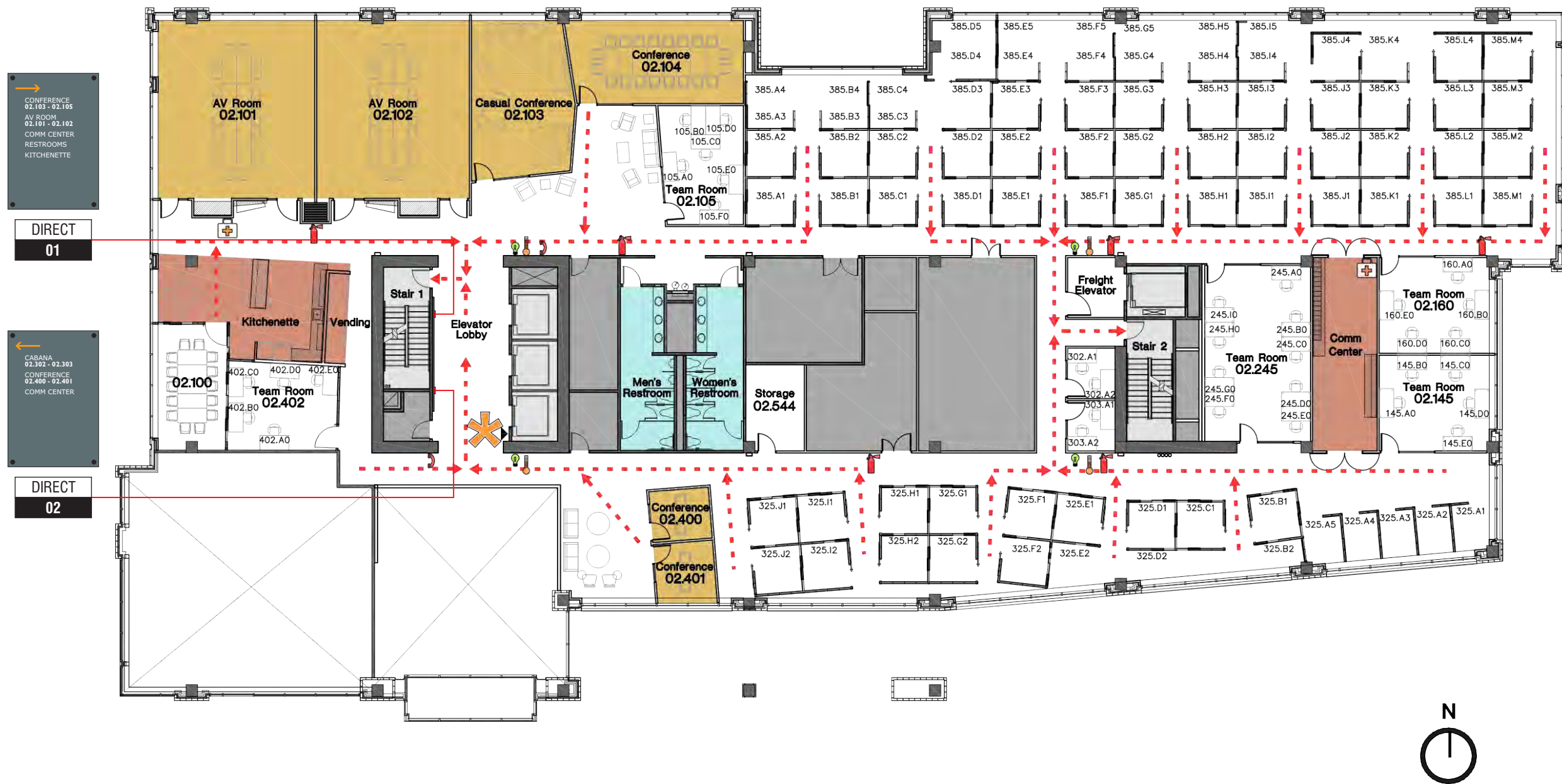
2ND LEVEL FLOOR PLAN