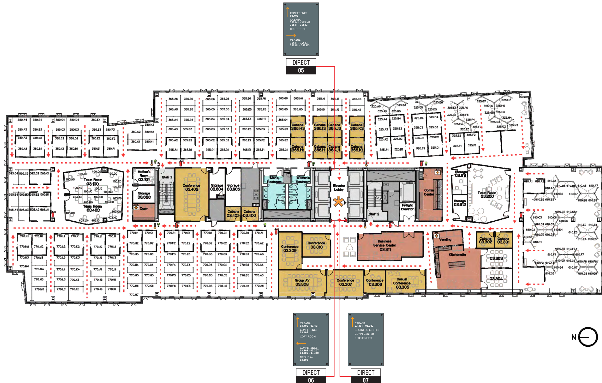
3RD LEVEL FLOOR PLAN