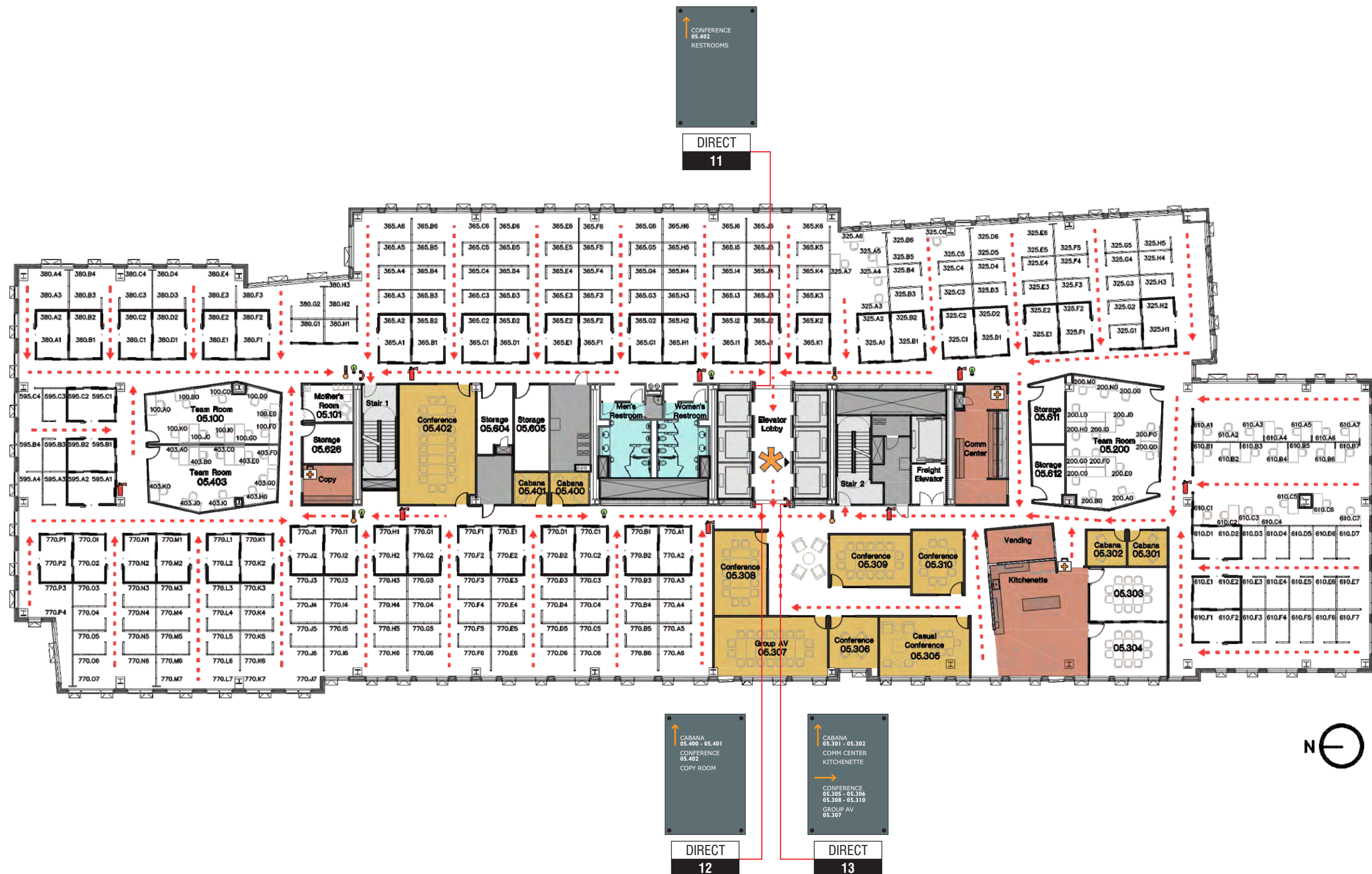
5TH LEVEL FLOOR PLAN