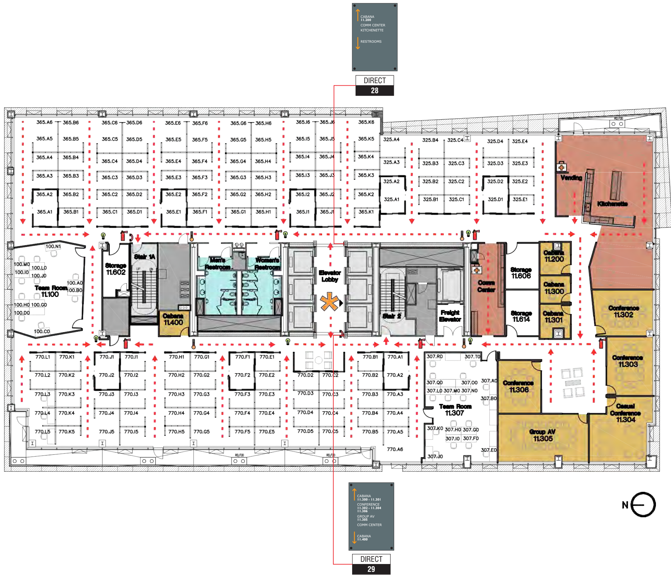
11TH LEVEL FLOOR PLAN

PRIMARY ELECTRICAL TO SIGN LOCATIONS IS TO BE PROVIDED BY OTHERS. 20 AMP DEDICATED CIRCUIT(S) WITH NO SHARED NEUTRALS AND A GROUND RETURNING TO THE PANEL IS REQUIRED FOR ALL INSTALLATIONS. THIS SIGN IS INTENDED TO BE INSTALLED IN ACCORDANCE WITH THE REQUIREMENTS OF ARTICLE 600 OF THE NATIONAL ELECTRICAL CODE AND/OR OTHER APPLICABLE LOCAL CODES. THIS INCLUDES PROPER GROUNDING AND BONDING OF THE SIGN.