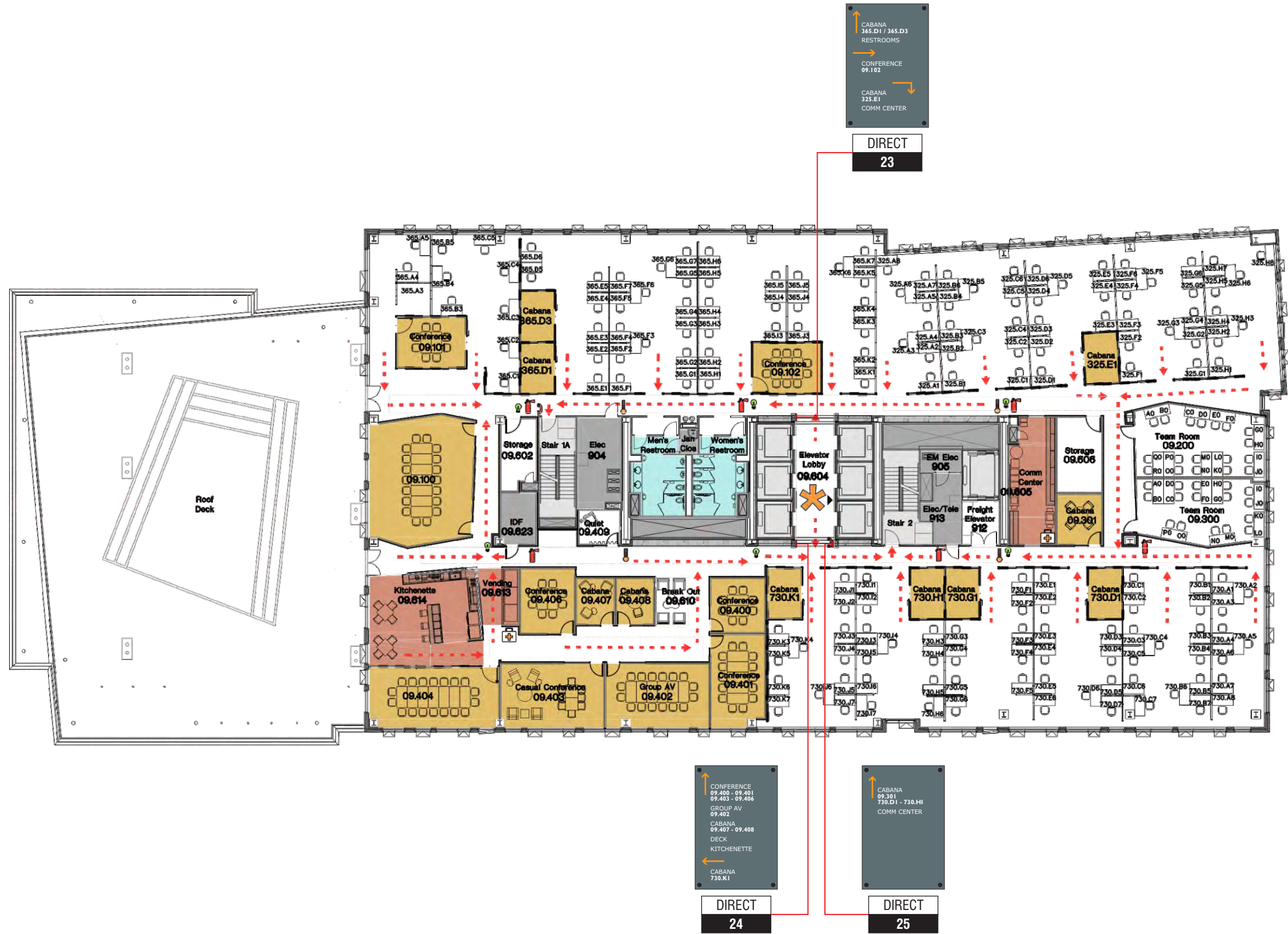
9TH LEVEL FLOOR PLAN

PRIMARY ELECTRICAL TO SIGN LOCATIONS IS TO BE PROVIDED BY OTHERS. 20 AMP DEDICATED CIRCUIT(S) WITH NO SHARED NEUTRALS AND A GROUND RETURNING TO THE PANEL IS REQUIRED FOR ALL INSTALLATIONS. THIS SIGN IS INTENDED TO BE INSTALLED IN ACCORDANCE WITH THE REQUIREMENTS OF ARTICLE 600 OF THE NATIONAL ELECTRICAL CODE AND/OR OTHER APPLICABLE LOCAL CODES. THIS INCLUDES PROPER GROUNDING AND BONDING OF THE SIGN.