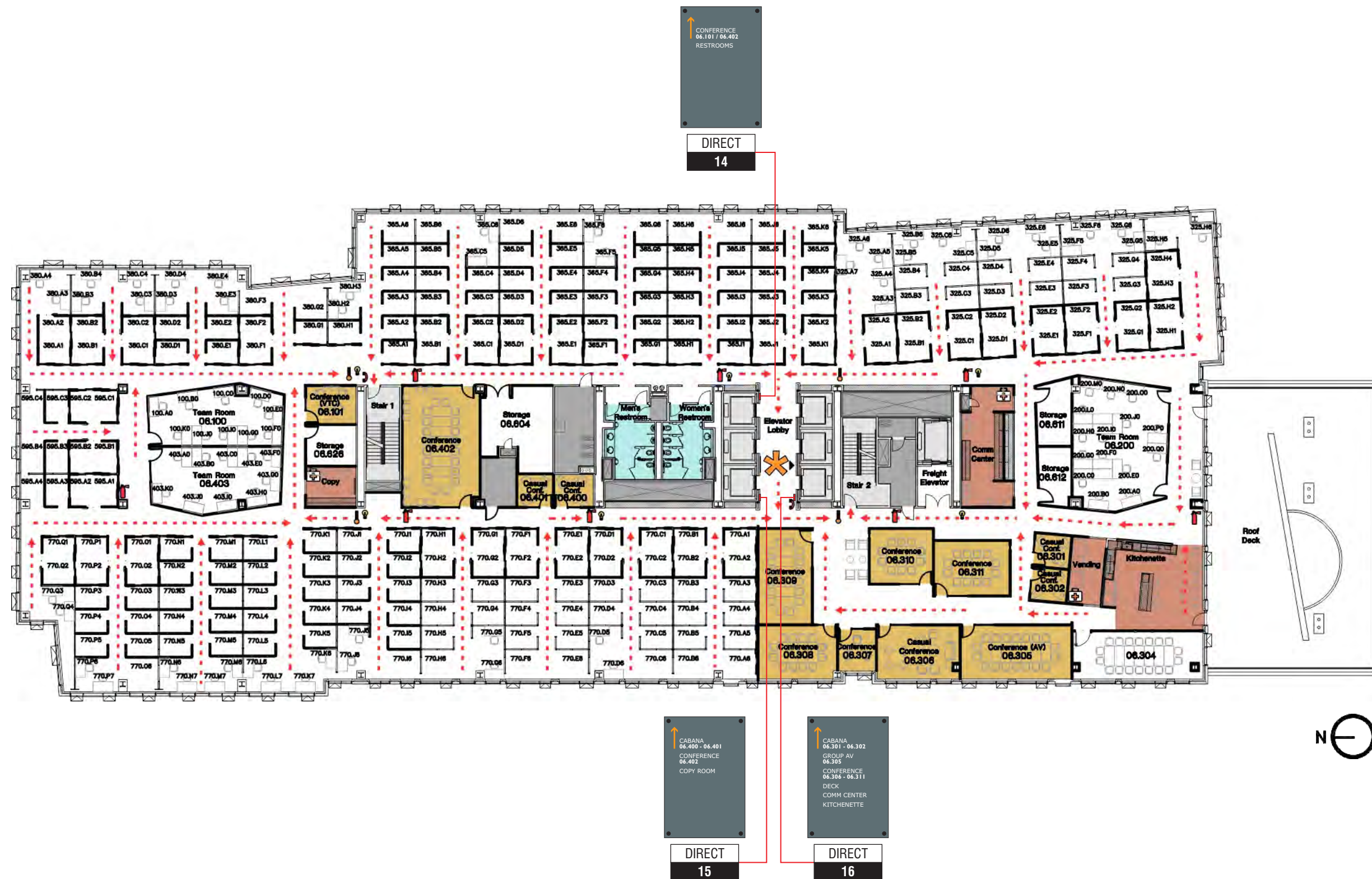
6TH LEVEL FLOOR PLAN