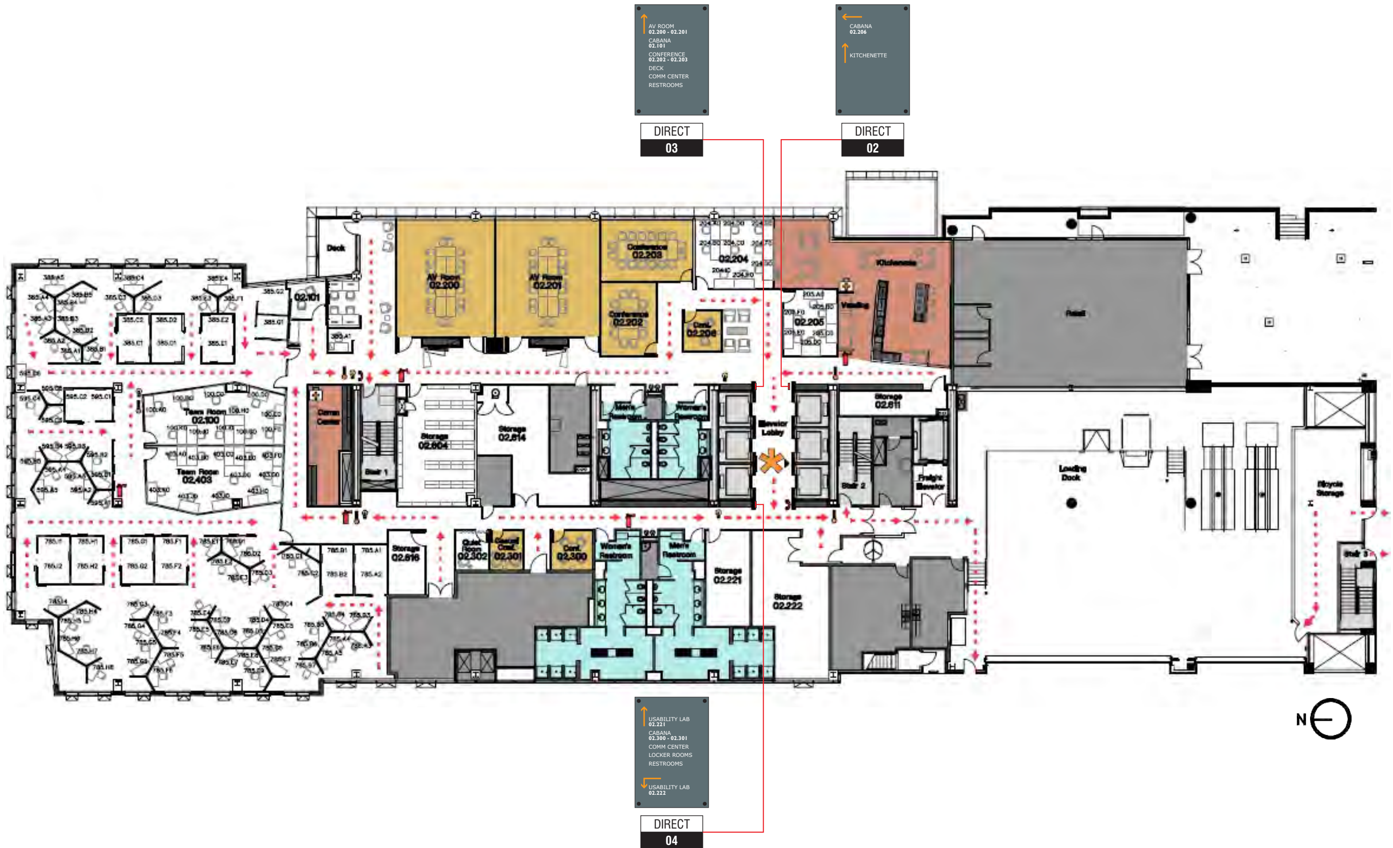
2ND LEVEL FLOOR PLAN

DATE 11-18-2013 DESIGN NO: Arizona Directional As-Built Record PROJECT LOCATION: Arizona Building SIGN TYPE: 2nd Level Floor Plan