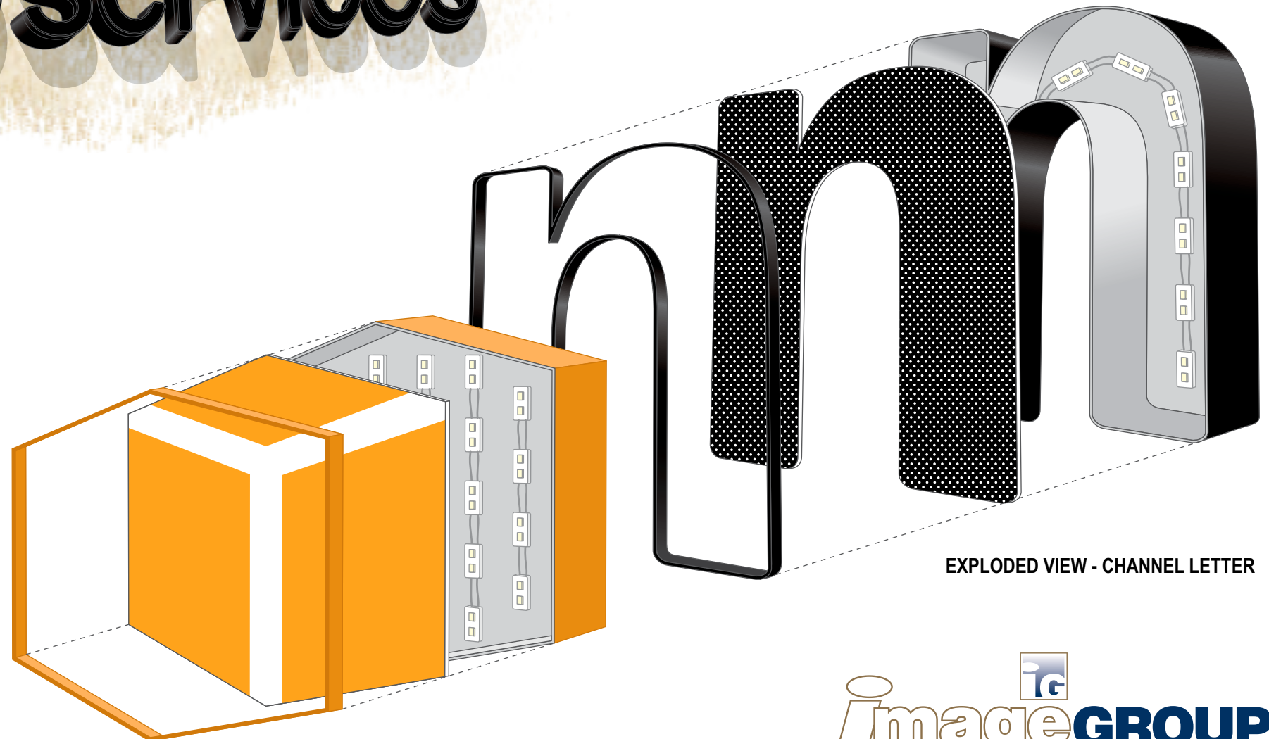
EXPLODED VIEW - CHANNEL LETTER

REMOTE 120 VOLT (1) DEDICATED 20 AMP/120 VOLT CIRCUIT REQUIRED